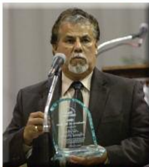
2009 Business of the Year Red River Regional Hospital